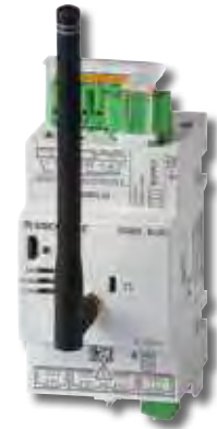
DIRIS B 010 A