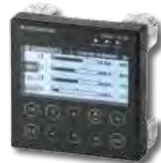
DIRIS D 001 A